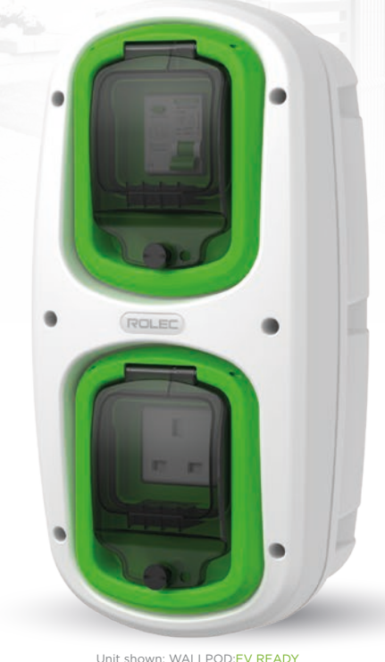
13amp Socket (Mode 2) Charging Unit